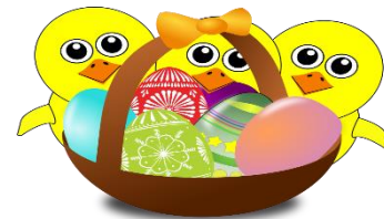
Table Favor Committee will not meet again until in April. Spring should have arrived by them and we will be working on Easter favors and those for May. Watch for Date and time next month.